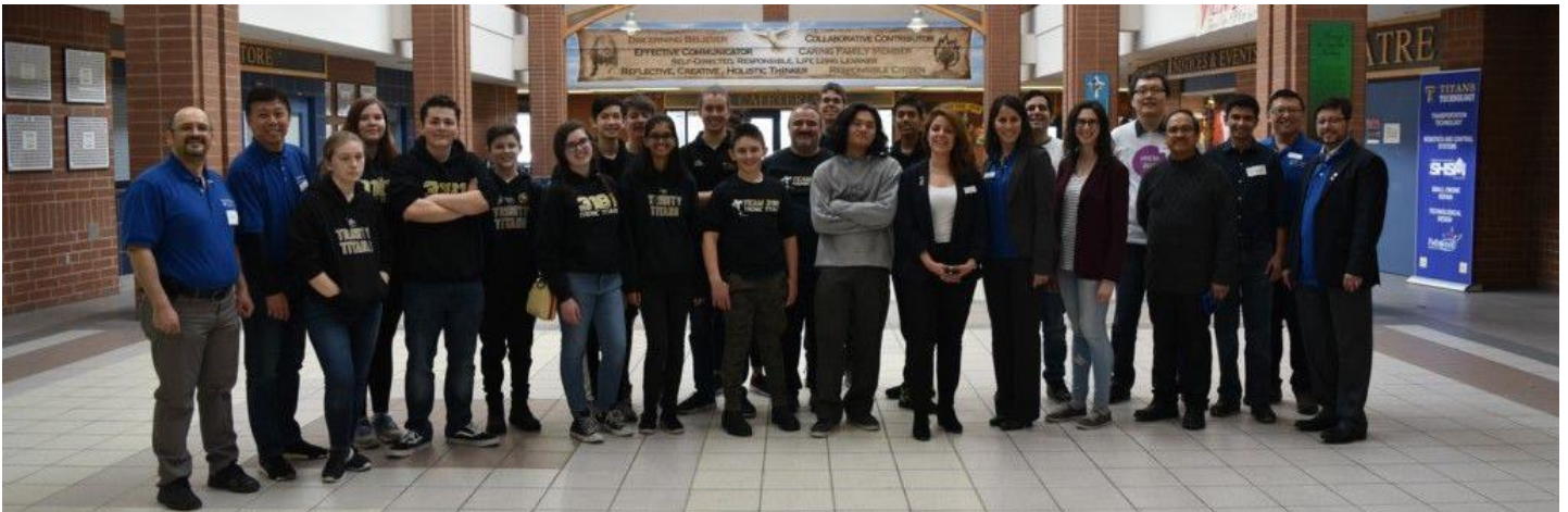
PEO Oakville Chapter and student volunteering team

We would also like to thank our main event sponsor Ontario Power Generation for their generous sponsorship and our many volunteers from our chapter, Holy Trinity teachers and students to make this event possible and successful.